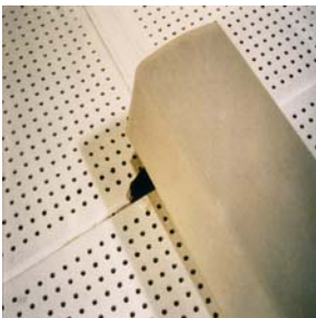
Perforated AIB ceiling tiles