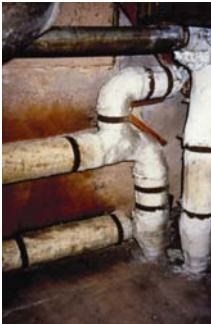
Asbestos pipe lagging

Here are some examples of asbestos-containing materials.