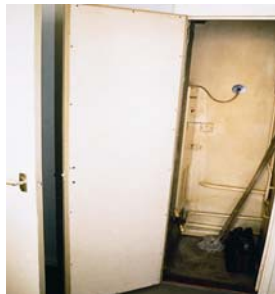
Door with AIB panel